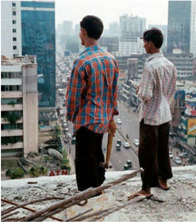
Increasingly frequent and severe floods due to global warming might eventually slow or even stop the growing urbanisation of Dhaka, Bangladesh, which is currently home to 13 million people.