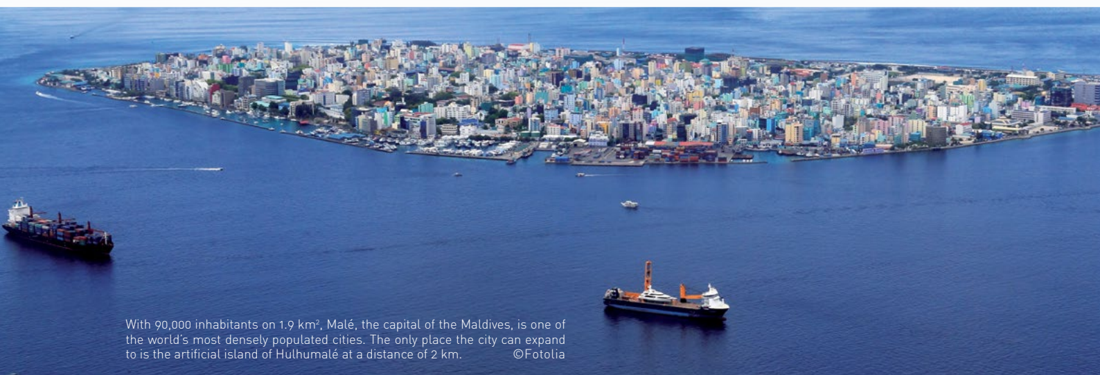
With 90,000 inhabitants on 1.9 km 2 , Malé, the capital of the Maldives, is one of the world's most densely populated cities. The only place the city can expand to is the artificial island of Hulhumalé at a distance of 2 km.