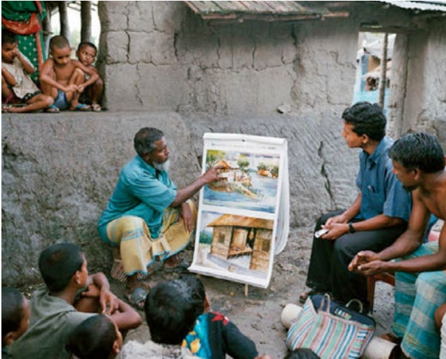
Citizens of Bangladesh, who are used to heavy floods, are now trying to adapt to climate change by taking appropriate measures. The photo shows an expert providing advice to people in a village.